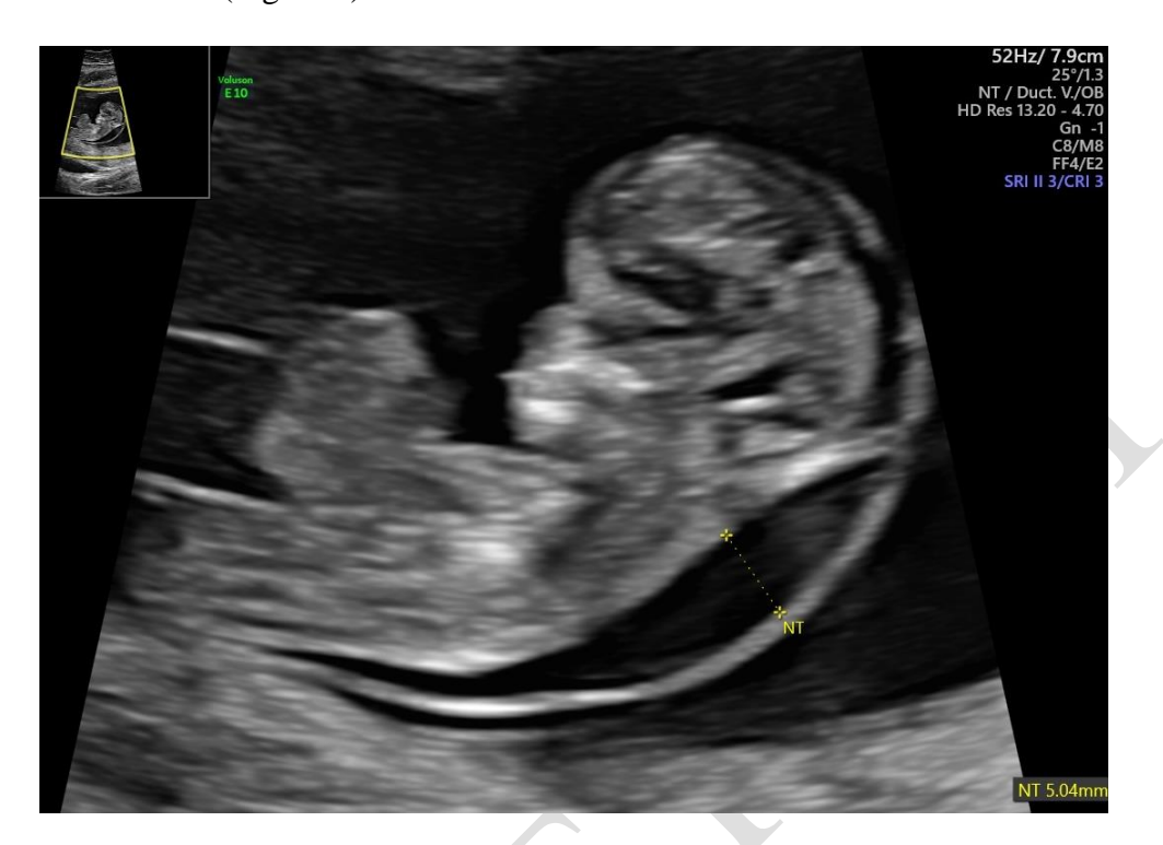
Figure 6. Extended nuchal translucency NT 5 mm

The swelling of the entire fetus was visualized – NT 5 mm (Figure 6) and reverse flow in the ductus venosus (Figure 7).