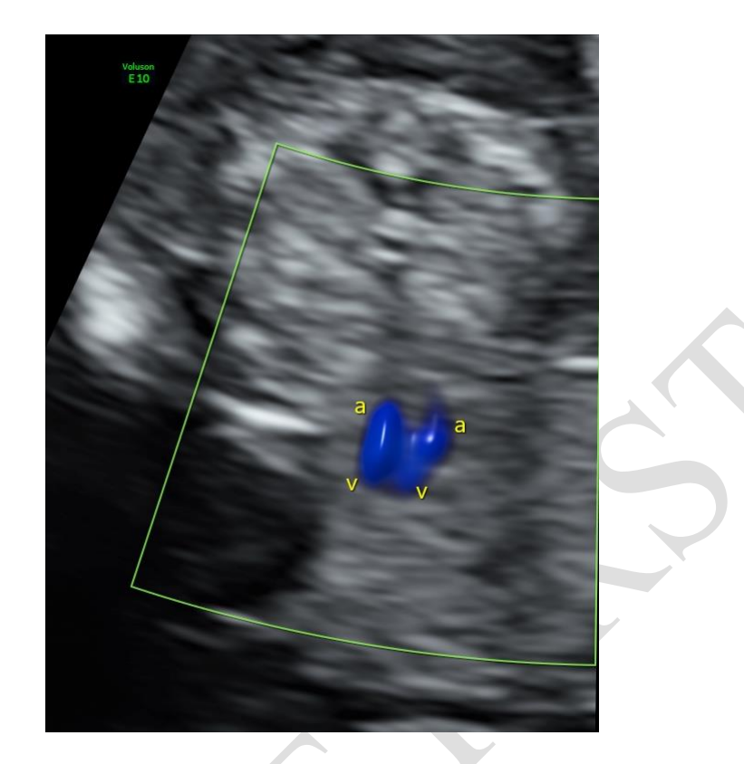
Figure 4. Fetal heart image at week 12 of pregnancy