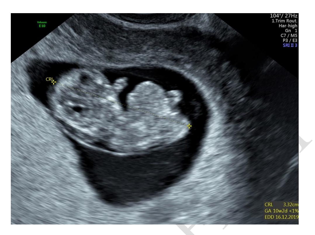
Figure 2. Fetal ectopic heart at week 12 of pregnancy based on the date of the last menstrual period