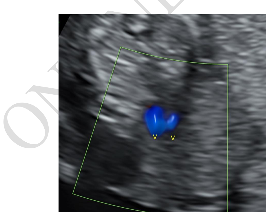
Figure 5. Fetal heart image at week 12 of pregnancy