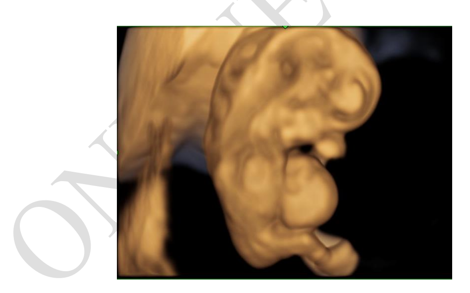
Figure 3. Ectopic heart in 3D ultrasound – week 12 of pregnancy

Figure 2. Fetal ectopic heart at week 12 of pregnancy based on the date of the last menstrual period