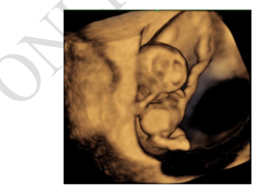
Figure 1. Fetus at week 12 of pregnancy with visible umbilical cord omphalocele

A thirty-three-year-old pregnant woman in her second pregnancy (the first pregnancy was unsuccessful – miscarriage at week 8 of pregnancy), visited a gynecologist for a routine check-up at week 12 of pregnancy, during which developmental disorders were found in the anterior chest cavity and abdominal walls. The woman was healthy, denied having chronic diseases, and was taking folic acid and vitamin preparations for pregnant women. The patient also denied the existence of any infections at an early stage of pregnancy. The woman was referred to the Laboratory of Prenatal Research, where, during prenatal ultrasound examination, the fetus was diagnosed with a complex defect of the skin and division of the body's cavities in the form of pentalogy of Cantrell. The fetus was diagnosed with umbilical cord omphalocele (Figure 1), diaphragmatic hernia with diaphragmatic defect, sternal defect, ectopic heart and pericardial defect (Figures 2-3).